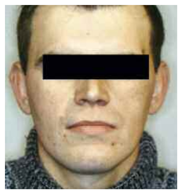
Figure 4. T-cell lymphoma: remission after the CHOP chemotherapy and radiotherapy

A 49-year-old white female presented to the clinic with a 3-week history of a painful and inflamed right maxillary process, but in good general condition. The dentist diagnosed the patient with chronic periodontitis, extracted teeth No. 14 and 15, and ordered treatment with clindamycin. However the treatment was unsuccessful and the patient's condition continued to deteriorate. Upon close examination of the oral cavity, inflamed oral mucosa and gross swelling of maxillary alveolar processes were noted. In addition to complaining about paresthesias of the right side of the face supplied by maxillary branch of the trigeminal nerve, the patient also developed annular inflammatory erythematous plagues on the trunk and extremities. During the dermatological consultation, the skin lesions were recognized first to be an allergic reaction to the infection or the drug. On the CT scan, radioopacity of most of the right maxillary sinus, right nasal cavity, and posterior part of the right pharynx was observed (Figure 5). Subsequent biopsies of the mucosa of the oral cavity only showed nonspecific widespread necrosis and inflammation. On gross examination, granulation tissue was noted on the palate, with necrosis of oral mucosa, palatine tonsil, and of pharyngeal and palatal arches (Figure 6). The third and final histopathological biopsy, performed also after the dermatological consultation, revealed an extranodal NK/T-cell lymphoma,