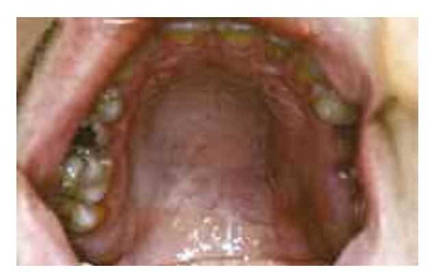
Figure 2. T-cell lymphoma: occupation of the mucosa

A 23-year-old white male presented with a 3-month history of a painless deformation of the left maxilla (Figure 1). The patient denied any pain or tenderness of the lesion at the time of the initial office visit. A redblue colored tumor began forming and enlarging progressively following removal of teeth No. 25 and 26, eventually extending from the suborbital to infranasal area. The oral mucosa was noted to be intact in the beginning (Figure 2). The CT revealed a tumor in the left maxillary sinus with destruction of the alveolar processes and infiltration of the ethmoid sinus, left orbital cavity, nasal cavity, and subtemporal fossa (Figure 3). The dermatological consultation suggested later in a biopsy the diagnosis of a high-grade diffuse T-cell lymphoma. The left submandibular, axillary, and inguinal lymph nodes were noted to be enlarged during the clinical examination. There were no signs of neoplastic infiltration in the chest and abdomen. In spite of achieved remission with CHOP