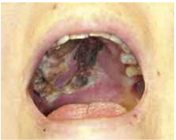
Figure 6. The extranodal NK/T-cell lymphoma, nasal type: necrotic lesions covered the entire palate, right maxillary teeth were destabilized

An epidemic of non-Hodgkin's lymphoma but not oth-