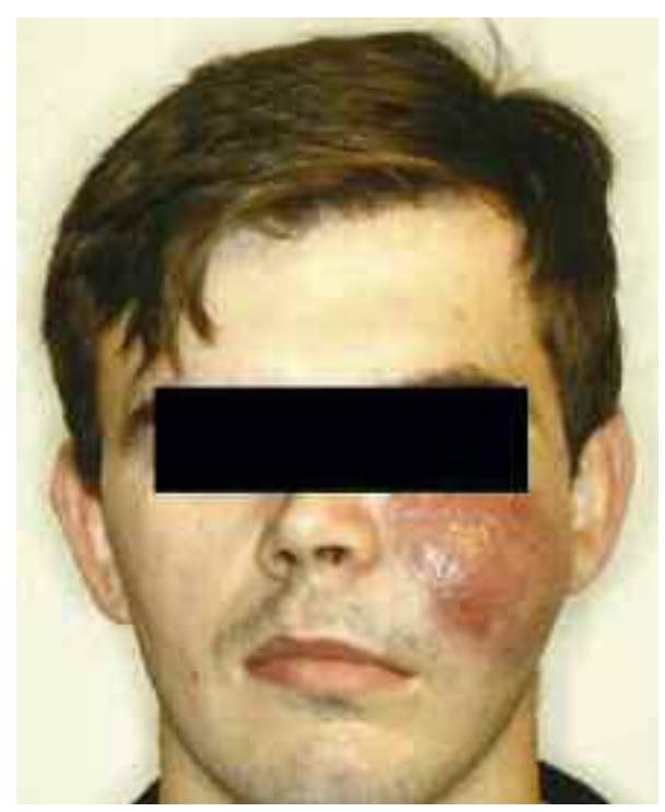
Figure 1. T-cell lymphoma: the red-blue colored tumor deformed left maxilla of the patient

A 34-year-old white female presented with a 2-year history of lesions initially recognized as acute periostitis with unknown etiology. The patient had additionally complained of fever, lack of appetite, weight loss, and night sweats. Hyperthyroidism was ruled out as a differential diagnosis. A radiograph of the oral cavity revealed a reduced density of roots of teeth No. 22 and 23, nonetheless, a diagnosis of hypercementosis was given by the histopathologist. The tooth pulp appeared unaffected at that time, however, in approximately 5 months, necrosis of the pulp of tooth No. 23 as well as a lesion resembling a periosteal abscess was found. The following biopsy confirmed the presence of ostitis. The inflammatory infiltration of the mucosal surface of both maxillary sinus-